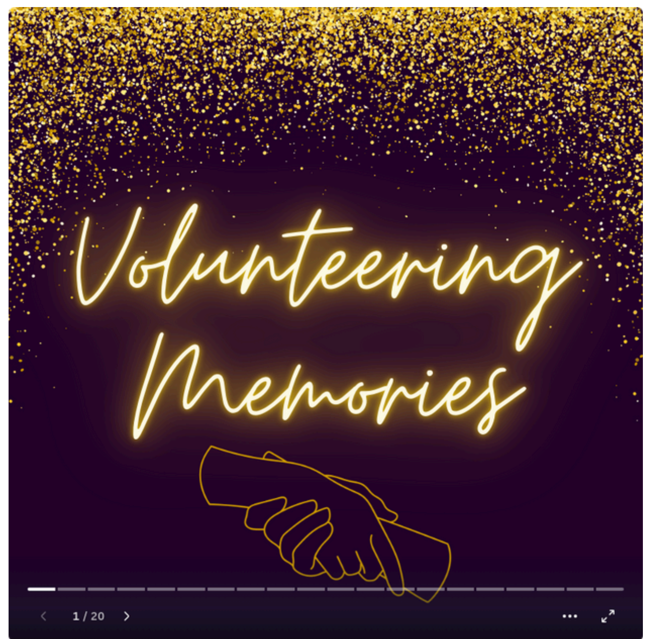
Scroll or expand to view our volunteer memories. If you have any memories you would like to share, please get in touch.

We have an online and physical exhibition to showcase the past 35 years of volunteering, brought to life by the volunteering memories of our staff, students, alumni and community partners. We hope you take the time to visit our exhibition and enjoy looking back through the last 35 years of volunteering.