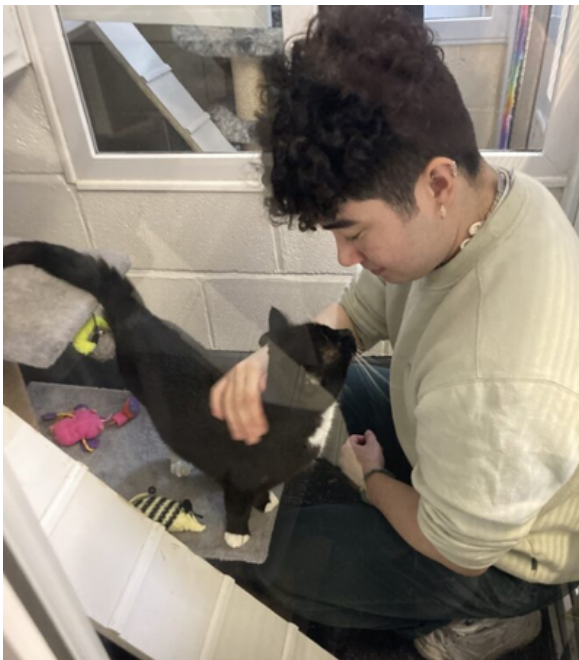
Volunteer socialising with cat at Stray Aid (15-02-24)