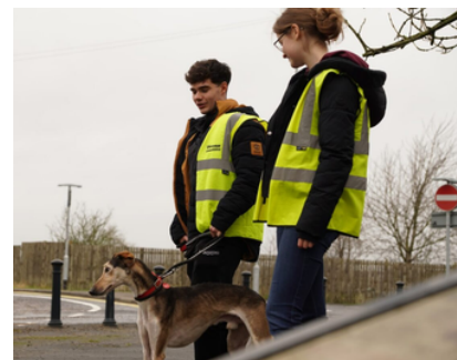
Volunteers walking dog at Stray Aid (15-02-24)