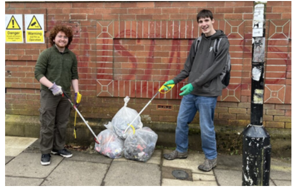
Hedgehog Friendly volunteers litter-picking (17-02-24)

Sessions included litter picking at Crook Hall Gardens or with Wear Rivers Trust, gardening at Old Durham Gardens and St Margaret's Church to supporting the Durham Park Run, primary school Valentine's disco, or donating in the Once a Month sanitary product drive.